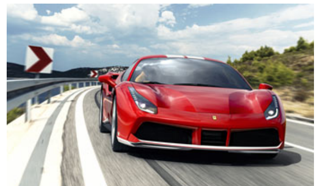
Fig. 4: STAR engineering CGI, AR and VFX products.