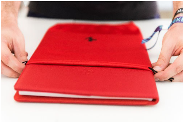
Fig. 2: Personalized owner literature