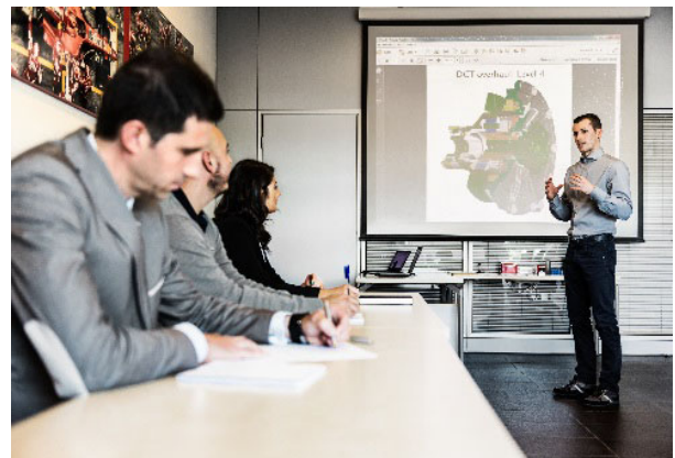
Fig. 3: Ferrari Training Classroom